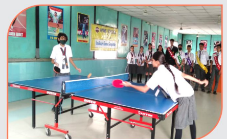
Indoor Sports-Ambe School Manjalpur

Sports are not just about competition. It is about having fun, being physically active, building coordination and team work amongst students. Students get an opportunity to display their self-confidence, patience and sportsmanship.