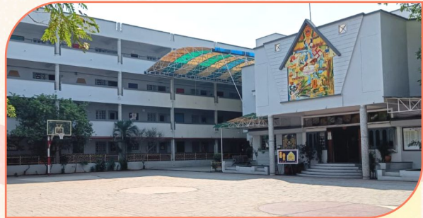
SHREE AMBE VIDYALAYA, Waghodia Road Vadodara - 390 019. Phone : +91-81410 88880 / 81410 88881