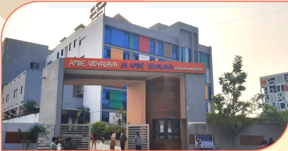
AMBE & JAI AMBE VIDYALAYA, Harni Bh. Rhythm Hospital, B/s. Panchamrut Flats, Harni, Vadodara-390022 Contact us M.63564 10410, 98240 66533