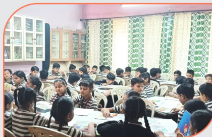
Library - Ambe School Manjalpur

At Ambe Group Of Schools, we are very proud of our caring, inclusive ethos where we set high standards and expectations for our students to achieve and behave their very best. Keeping the same set of values intact & continuing with the culture, tradition & moral ethics of Ambe Group which are followed since 32 years, we at Ambe School CBSE Harni, will strive to offer the right kind of educational system. From the moment a new Ambeite joins our school community, we want them to feel a sense of belonging & happiness, as this is essential for their future success.